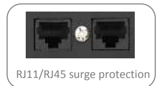
RJ11/RJ45 surge protection