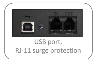
USB port, RJ-11 surge protection